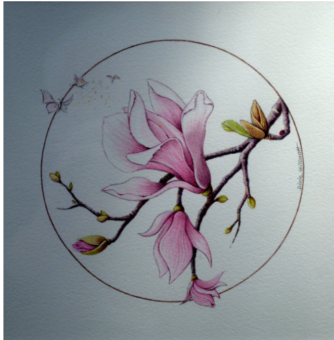
"Springtime" by Dixie Willmott

A most delicate, graceful, perfectly balanced, and incredibly detailed study from nature. Exceptional use of the medium.