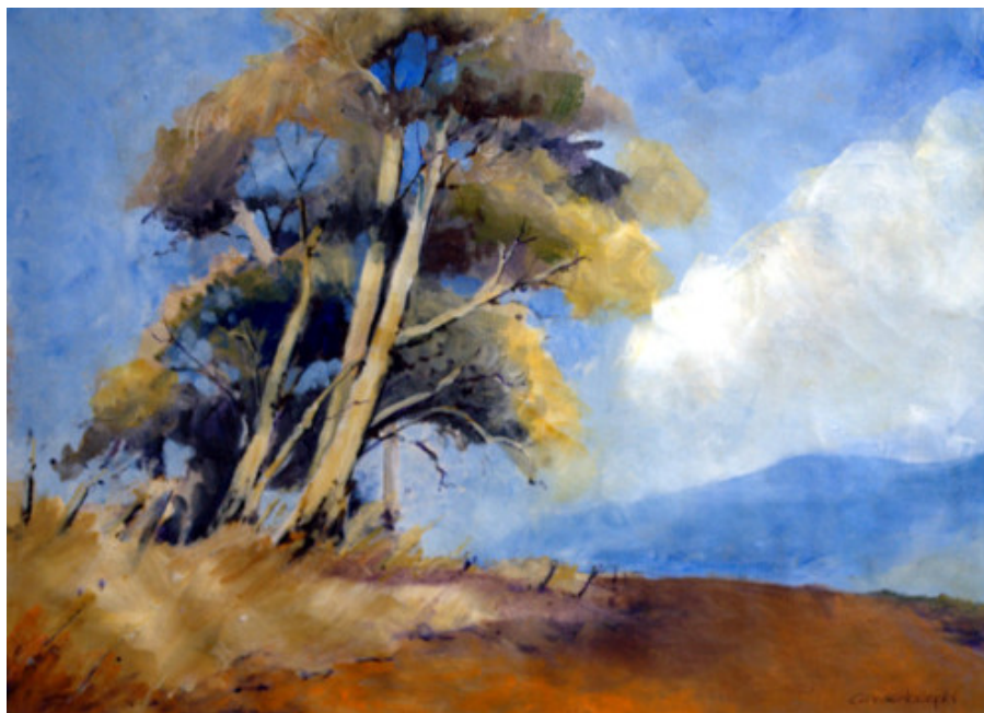
"Over The Rise" by Annie Joseph

A dynamic, captivating painting. Strong presence of the enduring landscape, powerful composition, dramatic tonal and colour contrasts. Expressive and confident technique.