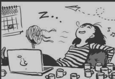
What My Boss Thinks I Do