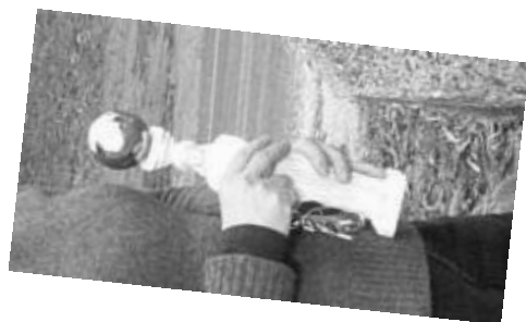
The Missing GOLDEN GLOBE

We will aim to ‘finish at 1.30 at Pugh's Lagoon so everyone can see what others have done and then go for lunch or you can paint on.